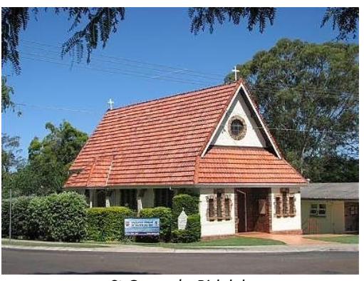
St George's, Birkdale