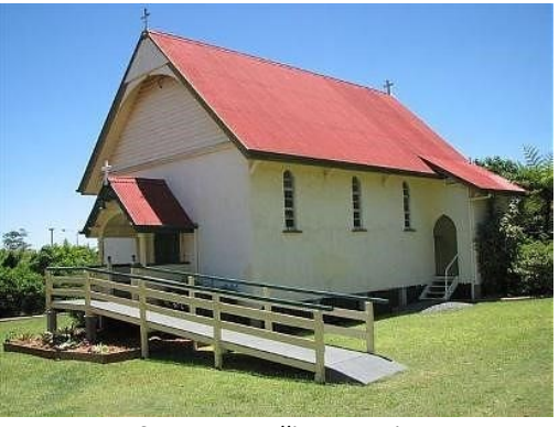
St James, Wellington Point