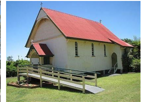
St James, Wellington Point

The parish has recently engaged in the Pathways Discipleship Program. Pathways begins by identifying the people within the span of influence of our church that we might meaningfully engage. In church planting literature, these people are sometimes referred to as a ‘mission focus group’ – i.e. the people with whom we’ll focus our primary attention in mission. Once we identified our mission focus group, Pathways encouraged us to think about following seven stages that map the journey from being someone who doesn’t know Jesus or his followers, to being a person who’s leading others in mission.