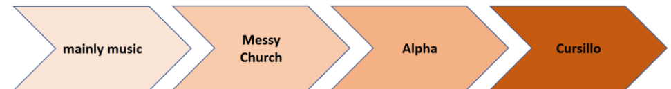
iPathways - example of a model

The parish is also committed to the development of a Mission Action Plan – the subject of this document.