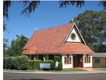
St George's, Birkdale

The Anglican Parish of Waterloo Bay consists of two community campuses based at St James’ Wellington Point and St George’s Birkdale. The Rectory is situated at Birkdale and therefore much of the church ministry is based on that campus.